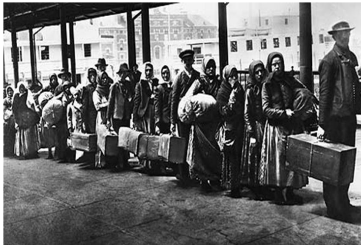
Picture 2 - Immigrants in the USA

The entire island has been owned and administered by the U.S. federal government since 1808 and has been operated by the National Park Service since 1965.